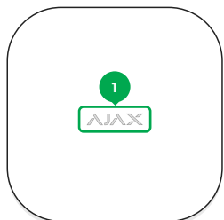
1 - Logo with a light indicator.